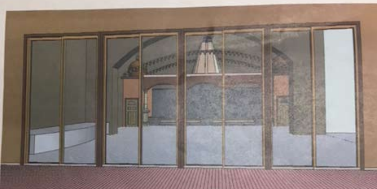
TEMPLE VIEW THROUGH SLIDING GLASS DOORS