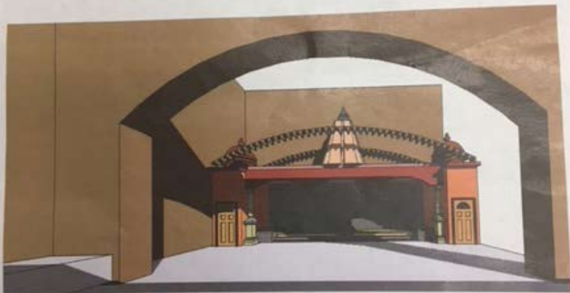
TEMPLE VIEW FROM INSIDE